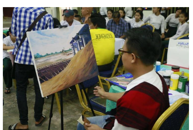
It has been said that "Art enables us to find ourselves and lose ourselves at the same time" This cleverly explains art's power. If the other humanitarian sectors that receive support in crises are the body, art is the mind. It plays the quiet role of keeping everyone in good and hopeful spirits; reminding people of their collective strength; sharing topics for contemplation; and keeping an account of the times in song, on paper or whatever other medium artists come to master with intrinsic motivation.

primary stakeholders are artists all demographics from 6 target regions (Yangon, Dawei, Magway, Hpa An, Pathein and Meikhtila), not limited to any artistic background. It includes artists from a variety of artistic disciplines who find themselves facing difficulty to get on with their craft, but with the desire to be active in creating and proactive in playing a part in their community and local art scene. Women as well as artists from minority religious, and ethnic backgrounds, and sexual orientations and artists with disabilities will be given special consideration. The project will culminate in a final event that will exhibit what the artists have achieved during the granting period, for the public and for peer-to-peer appreciation and inspiration.